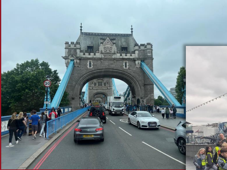
Amazing city views...