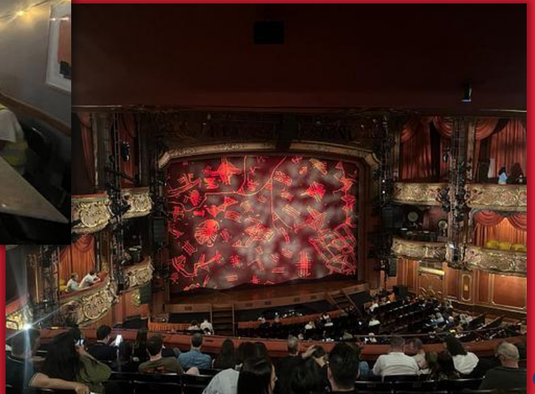
Followed by a trip to the theatre to see the Lion King...