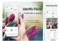
PictureThis – Plant Identifier