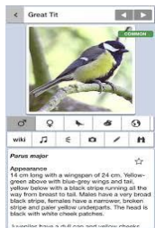
Birds of Britain Pro: Lite Edition

https://www.boredteachers.com/resources/40-science-websites-to-keep-kids-engaged-and-entertained-at-home